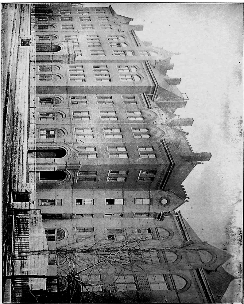
NEW YORK HALL.