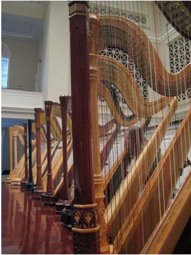
Harp standing ready in Alumni Chapel