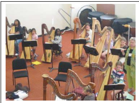
Harp Ensemble in Instrumental Rehearsal Hall