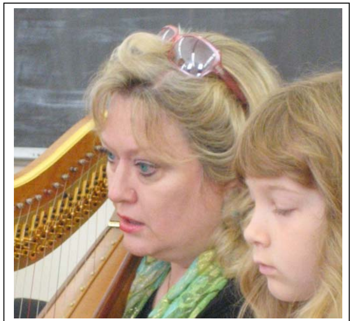
McClure and student